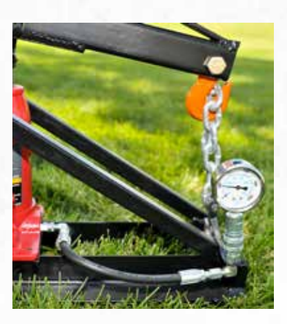
LL-2 Load Locker